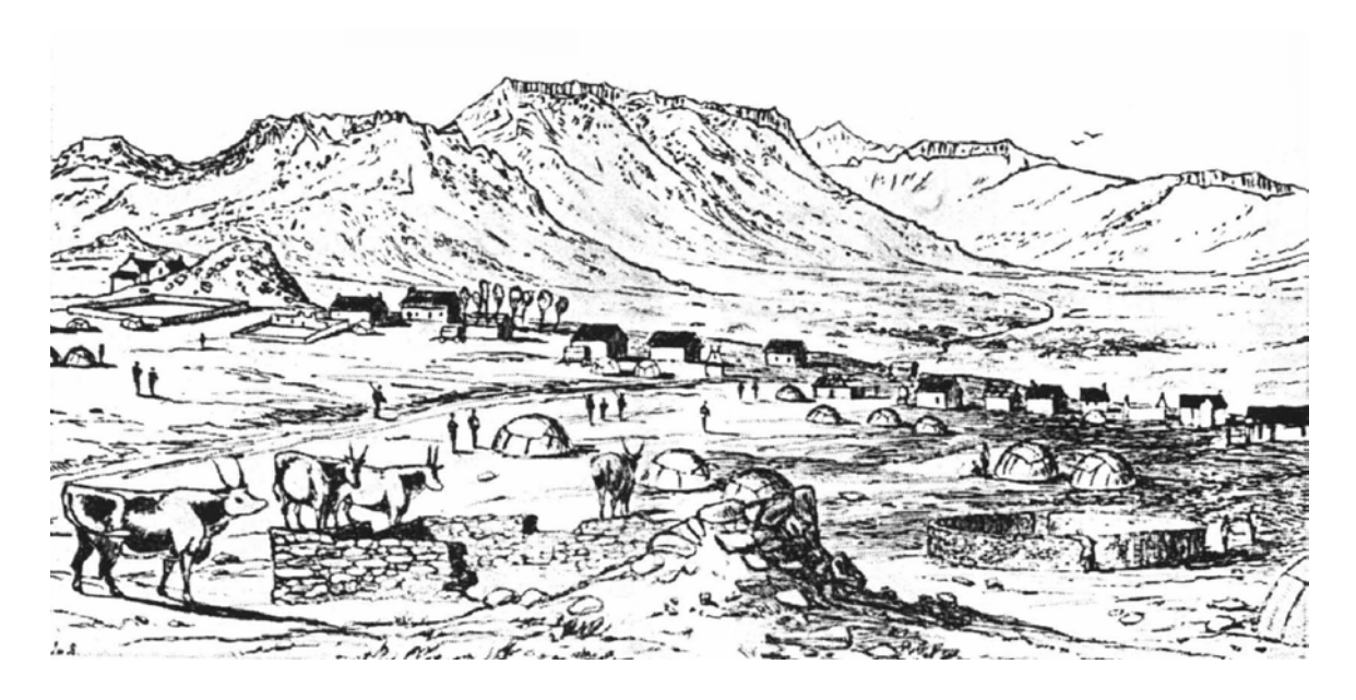
Figure 2: Historic illustration of Philippolis (Potgieter 1973:520)

Philippolis is the oldest town in the Free State province (figure 2). A mission was founded in 1823 by ministers of the Dutch Reformed Church. In 1824 a school was instituted in Philippolis for the Griqua and in1873 the first schoolhouse at Philippolis was built. The Annual Register for 1832 cites between 160 and 250 people frequenting Sunday worship and about 60-180 students attending school in Philippolis (Van de Sandt 1843).